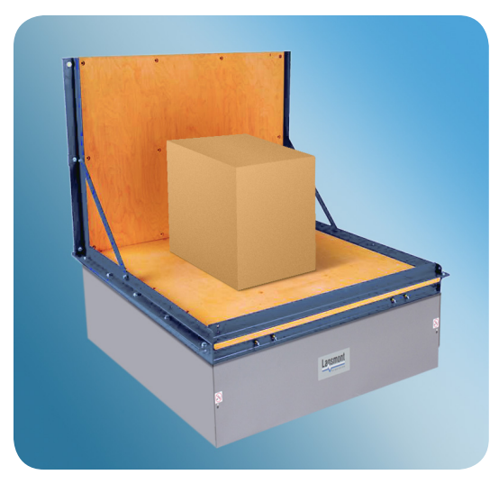
MS 400 with Tall Fence