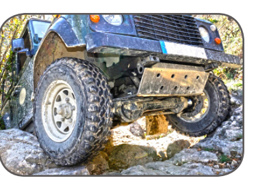
Off Road Measurements